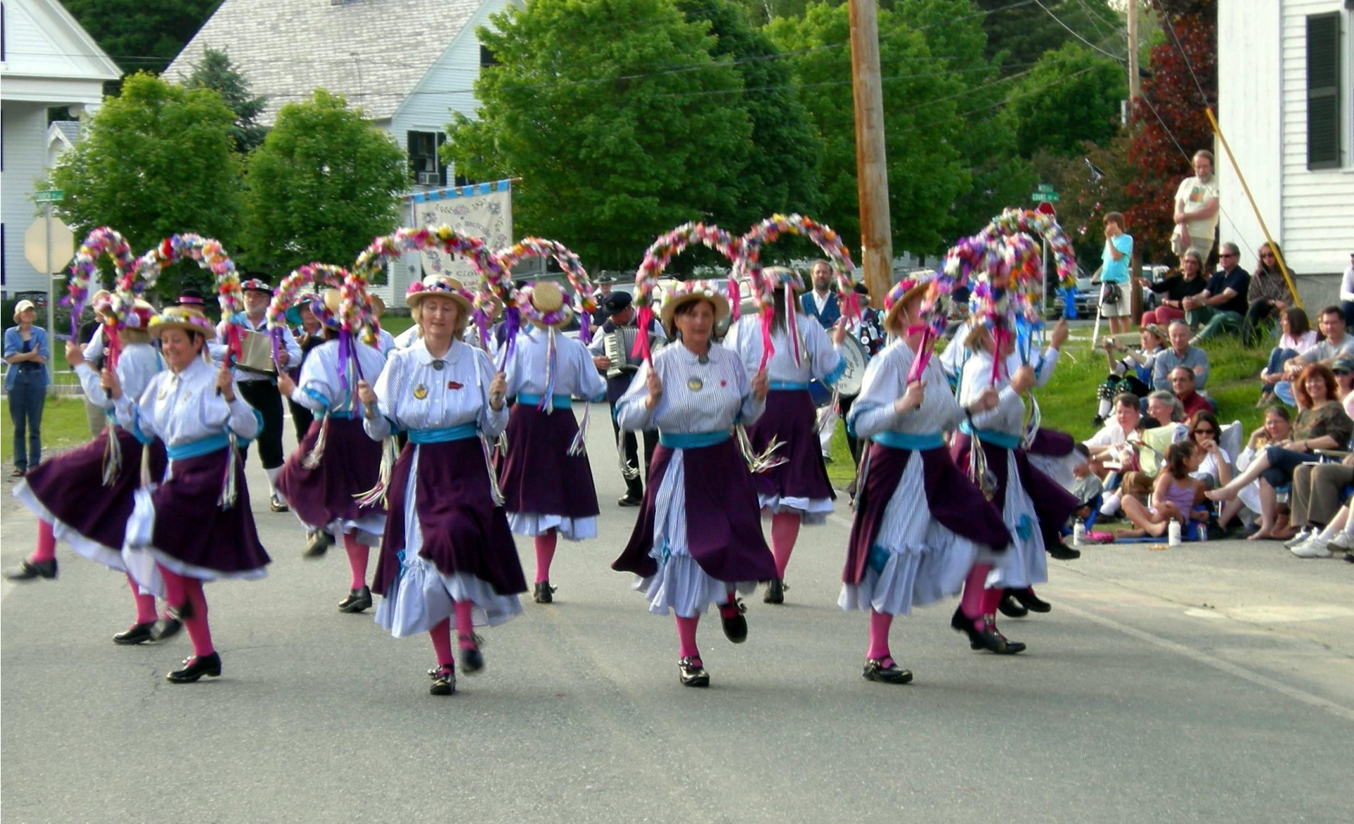
Kettle Bridge Clogs (an English side), North West morris Vermont, USA, 2009