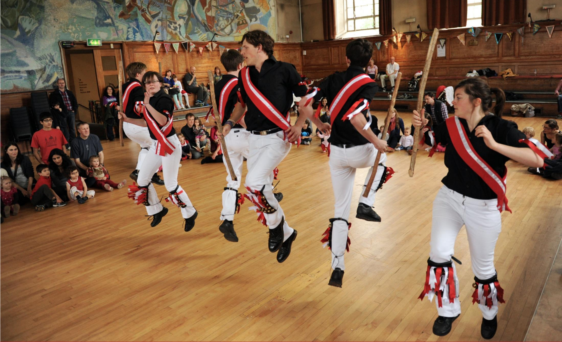
Fool's Gambit Morris, Cotswold morris EFDSS May in a Day! festival, Cecil Sharp House, London, 2013