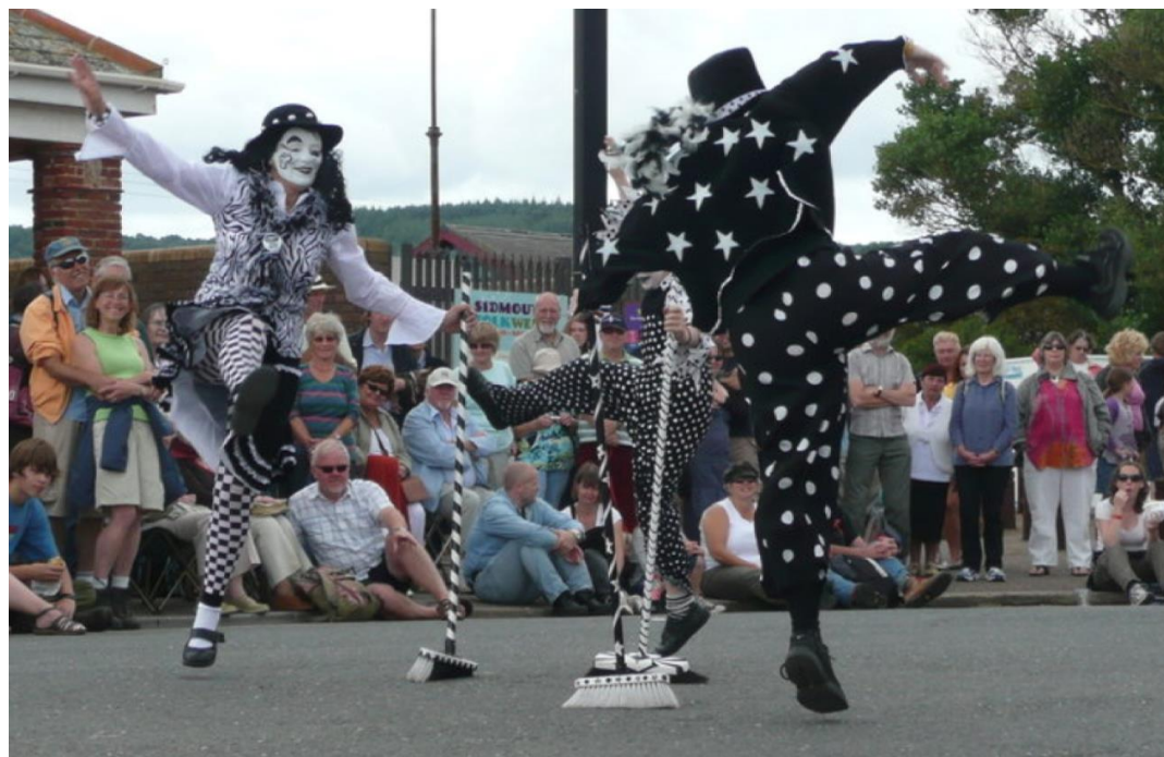
Pig Dyke Molly Dancers performing a broom dance Sidmouth Folk Week 2012

One of the dancers, the Molly, is usually a man dressed in women's clothes, but the entire team may be cross-dressed (men and women).