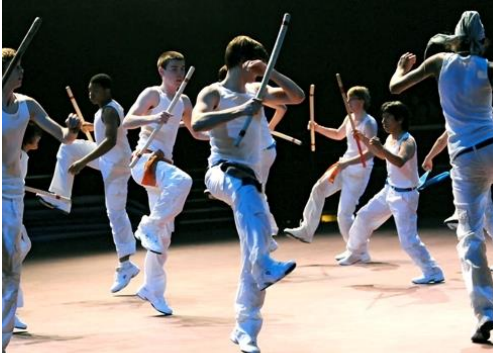
Spring Force contemporary Cotswold morris, dancers So We Boys Dance EFDSS in partnership with Pavilion Dance / Dance South West, Royal Albert Hall, 2010