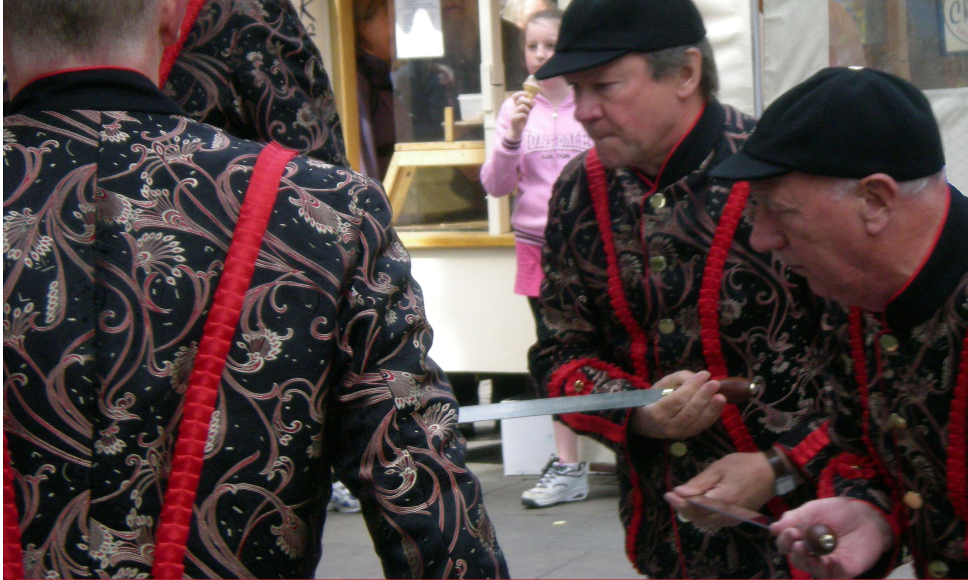
Grenoside Sword Dancers, longsword International Sword Spectacular, York 2008