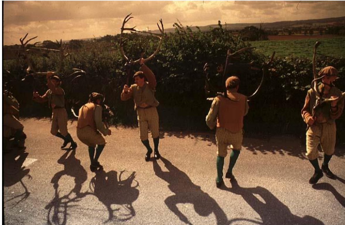
Abbots Bromley Horn Dance Staffordshire 1998

Another unique dance is the Abbots Bromley Horn Dance from Staffordshire. This features the Horn Dancers comprising six Deer-men, a Fool, Hobby Horse, Bowman and Maid Marian. A carbon analysis discovered that the antlers used in the dance date back to the 11th century.