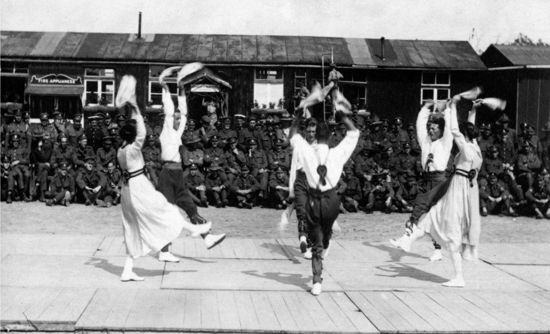
EFDSS display team, Le Havre, France, First World War Cotswold morris for rehabilitating troops